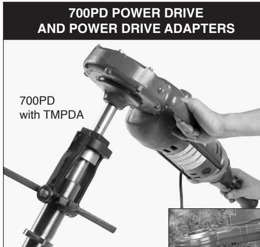
700PD with TMPDA

To learn more about adding power to drilling and tapping jobs, visit www.reedmfco.com .