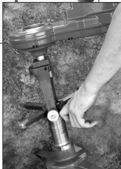
CPDWW on TM1100

To learn more about adding power to drilling and tapping jobs, visit www.reedmfco.com .