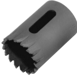
Heavy Duty Carbide-Tipped Hole Cutter