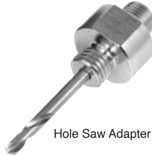
Hole Saw Adapter