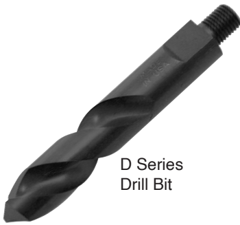
D Series Drill Bit

After purchasing any one of the Drilling Machines, the customer must purchase the appropriate drill bit, hole cutter, or shell cutter.