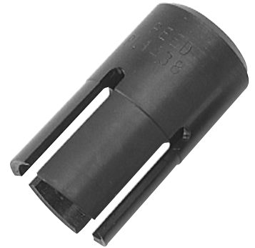
PVC Shell Cutter